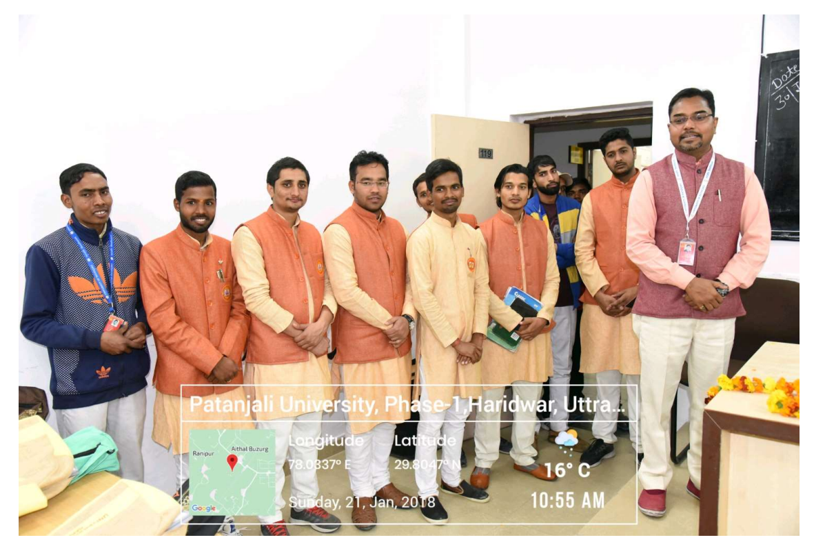
Mentoring session for the scholars of University.