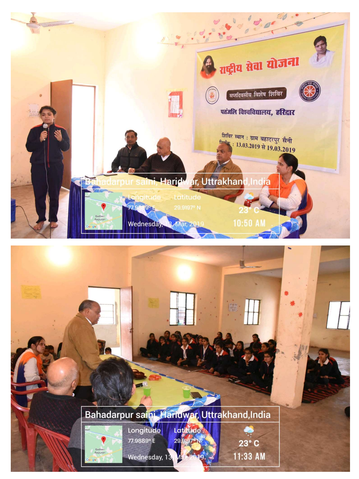
In house NSS activities conduction for the students of University.