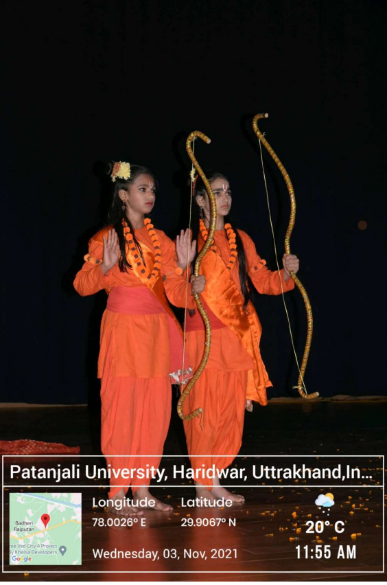
Public awareness program by the students of University