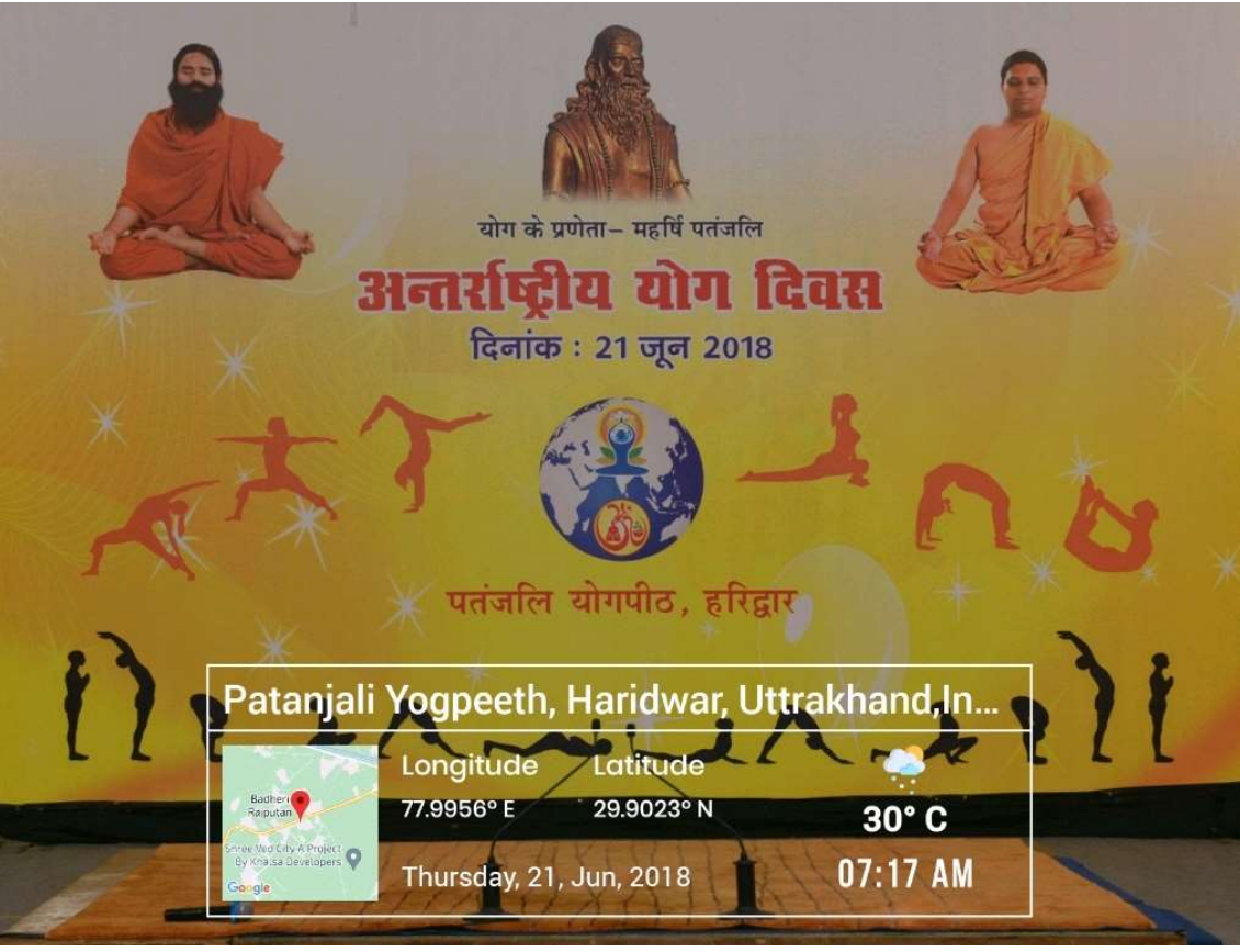
Celebration of International Yoga Day at Patanjali Yogpeeth