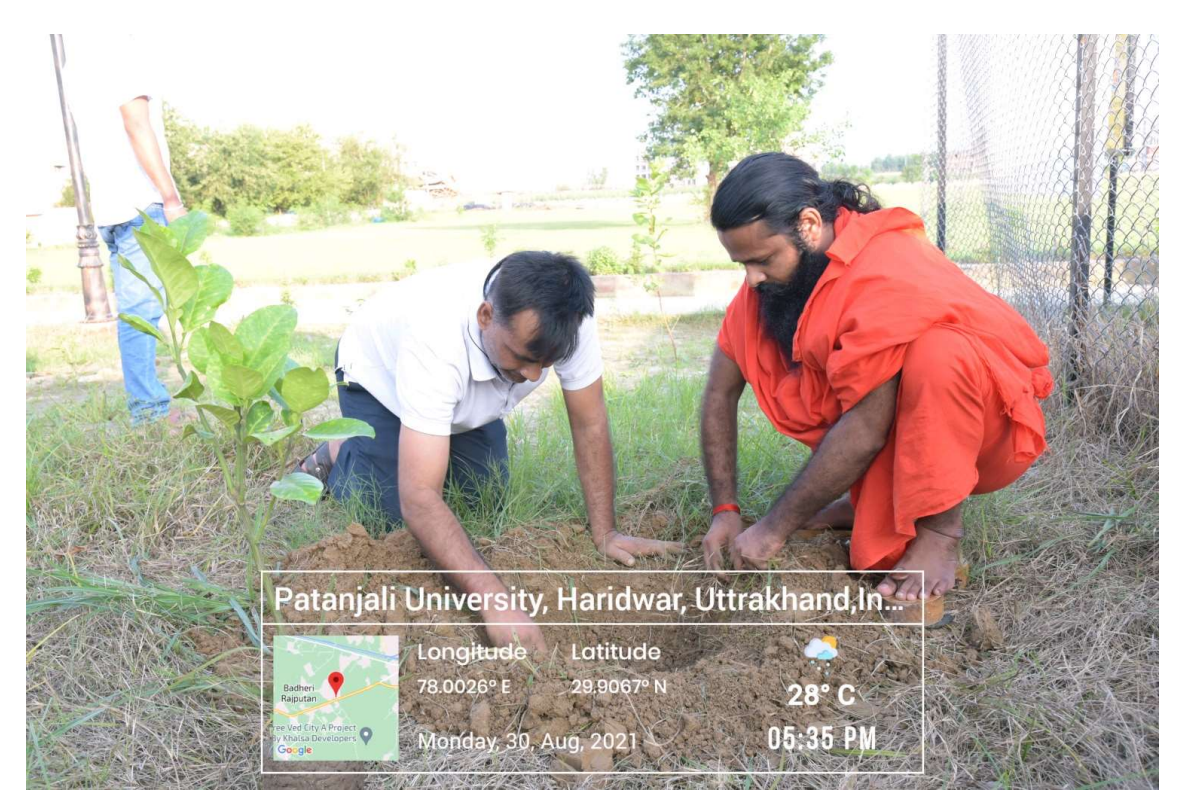
Tree plantation activity by faculties of University