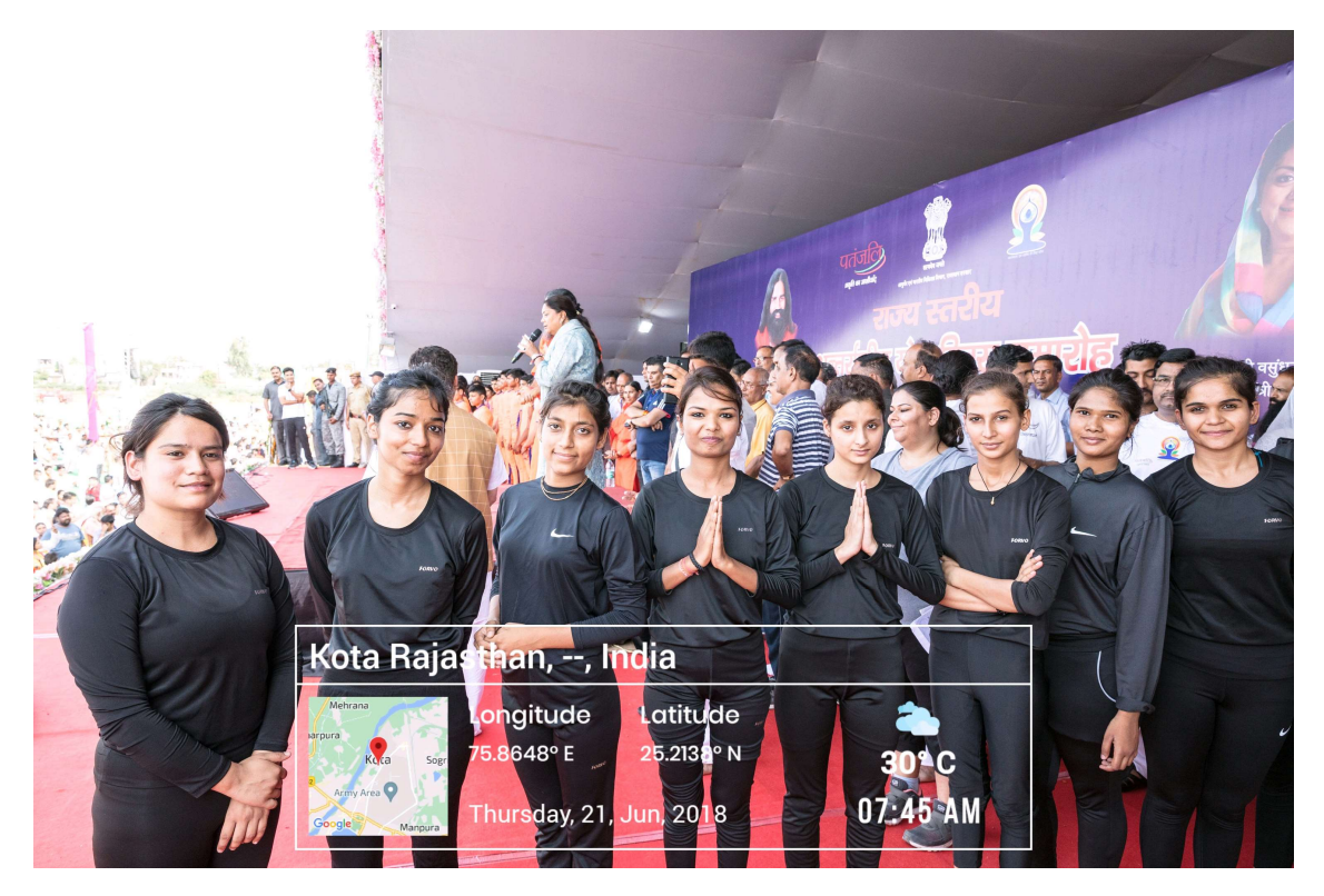
Awareness program by the students of the university for the Audience present in auditorium