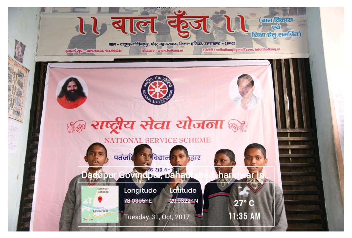
NSS activity by the students and faculty of the university at BalaKunj, Haridwar