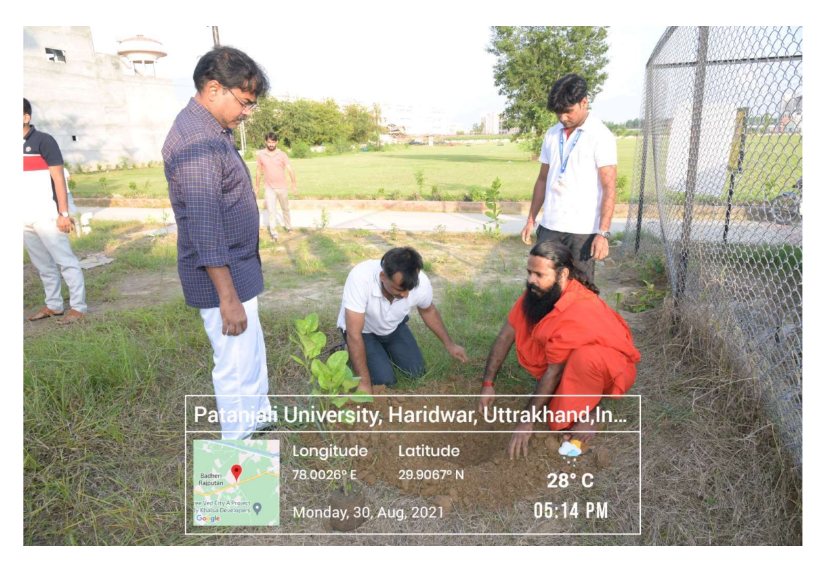
Tree plantation activity by the students of the university