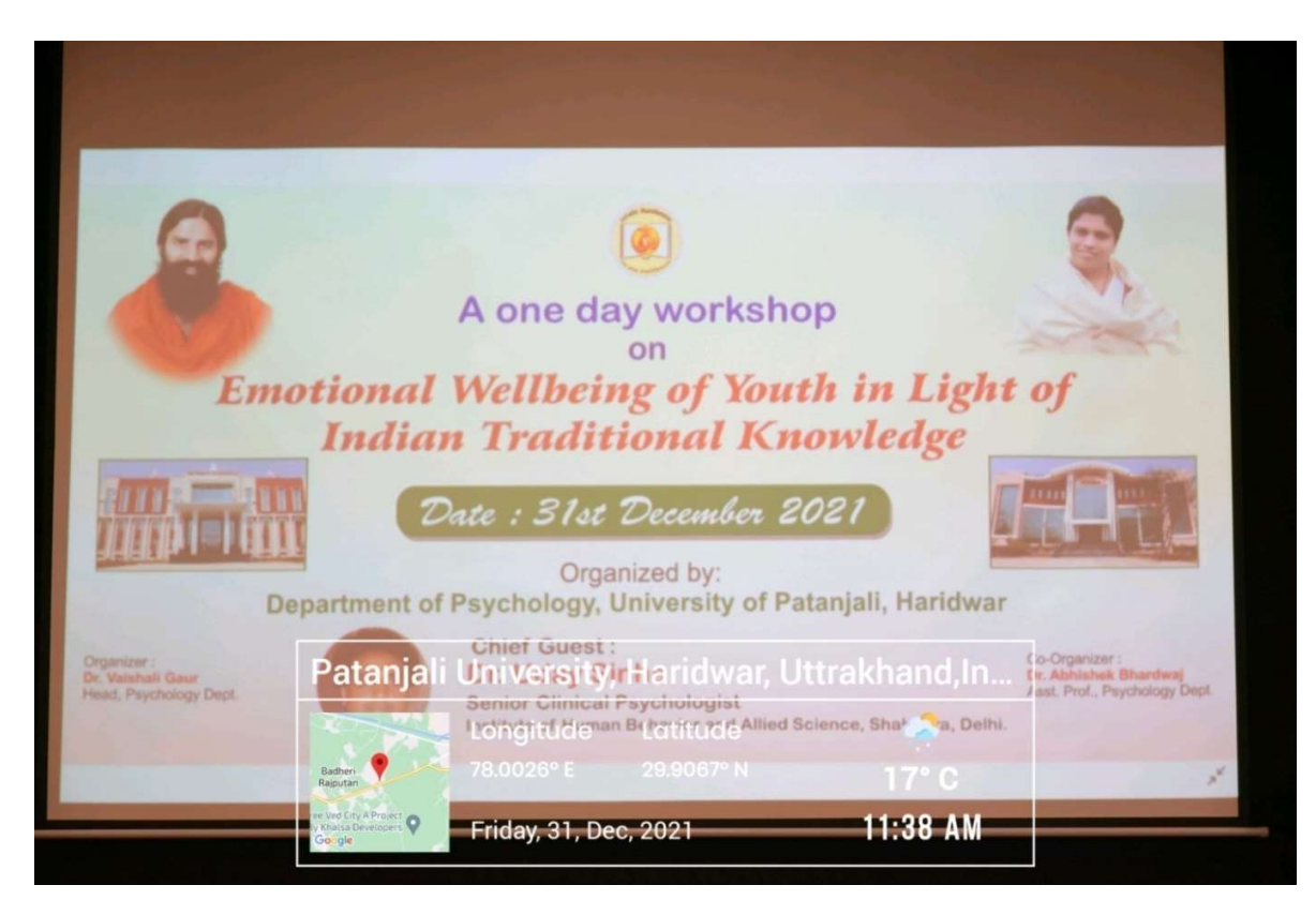
Workshop on Emotional Wellbeing of Youth in light of Indian Traditional Knowledge