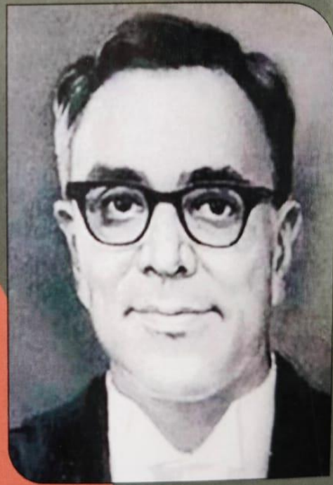
Mulk Raj Anand