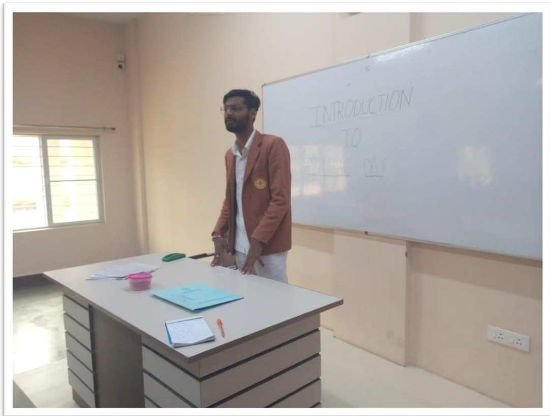
On 25/01/2023, Class Discussion on Topic "Introduction on Republic Day", BA 4 th Sem (Tourism Students).