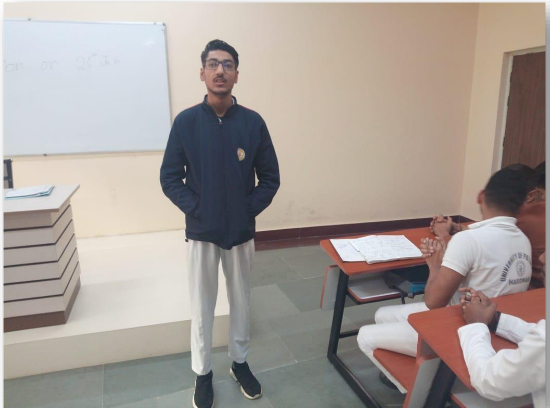
On 25/01/2023, Class Discussion on Topic "Introduction on Republic Day", BA 4th Sem (Tourism Students).