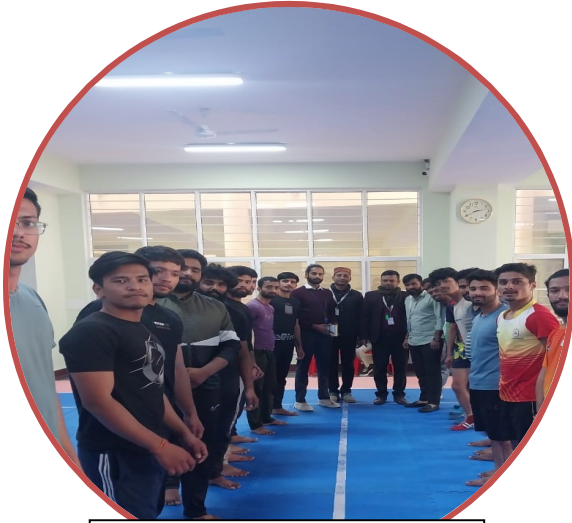
Before match 01