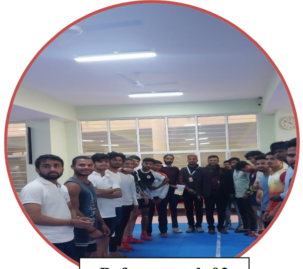
Before match 02